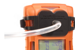
Bump/calibration plate To apply test gas to T4

Respo Products Respo Safety Solutions Pvt. Ltd. D-595, Kamla Nagar, Agra 282 005 +91-562-2881590; 2885331 1800-180-73776 info@respoproducts.com http://www.respoproducts.com