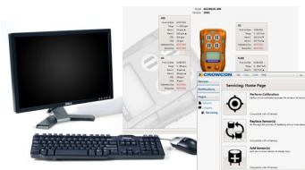
NEW Portables Pro 2.0 Software For easy configuration and servicing