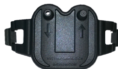
Aspirator plate Sample atmosphere prior to entry