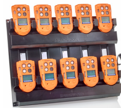
10 way charger For charging and storing your T4 fleet