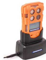
Cradle charger Docking station for easy charging