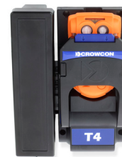
Vehicle charger Effective charging and storage whilst travelling