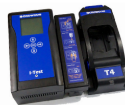
I-Test Easy automated bump testing and calibration solution