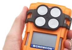
External filter plate Clip-on filter for dusty environments