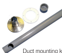
Duct mounting kit